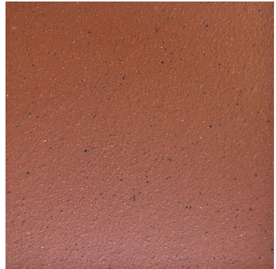
15 x 15 cm (6 x 6) MT.MAY.RED.IRON.6x6

Trims are also stocked for Metropolitan Series. Please ask your Sales Representative for further detailed information.