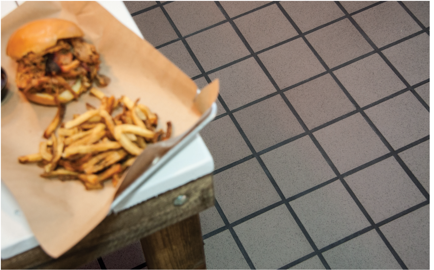
PURITAN GREY - Abrasive