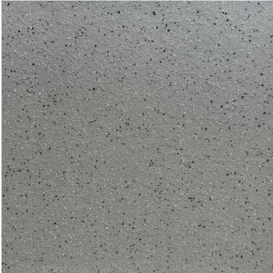
15 x 15 cm (6 x 6) MT.PTN.GRY.IRON.6x6