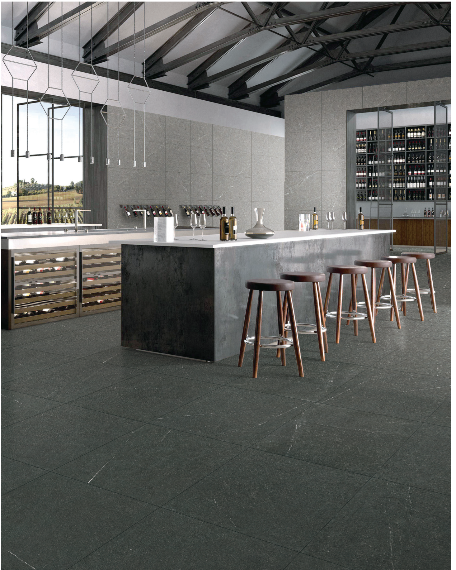
Black & Light Grey