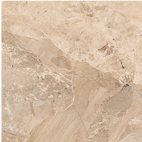
BEIGE Brushed Finish

60 x 60 cm (24" x 24") LG.CT.BGE.2424.BD