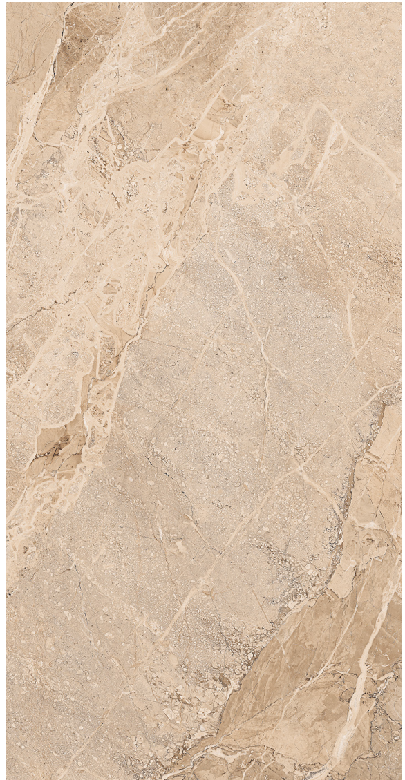
BEIGE Brushed Finish

60 x 60 cm (24" x 24") LG.CT.BGE.2424.BD